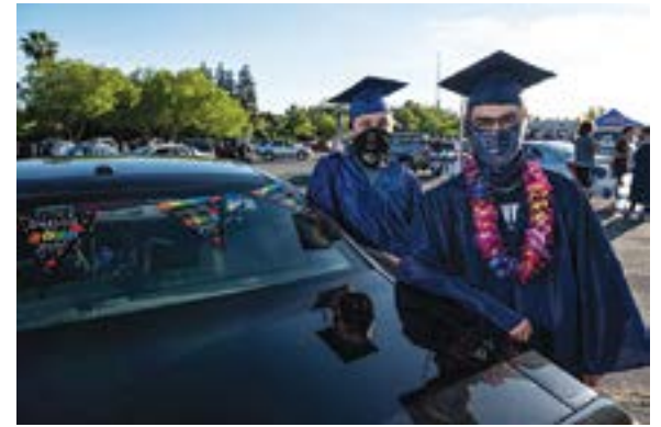
Casa Roble Class of 2020 Parades in Style

On a perfect night, in the quiet of the Sunrise Mall's back parking lot, the Casa Roble Class of 2020 had their night; celebrating in style, cruising in decorated cars, wearing their graduation robes and huge smiles as they paraded in front of family, friends and community who gathered together to cheer for the soon-to-be graduates.