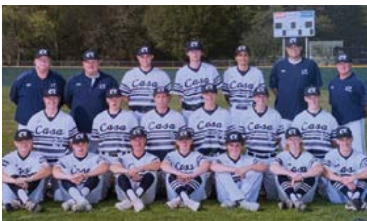
CASA ROBLE HIGH SCHOOL BASEBALL 2020