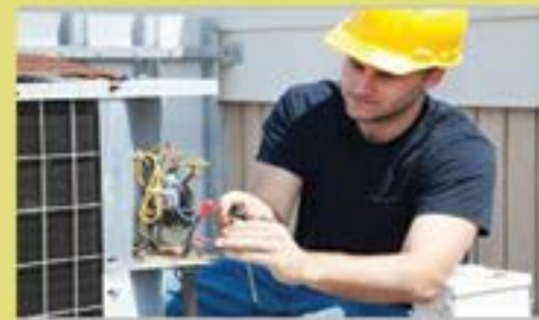
INSTALL AND REPAIR