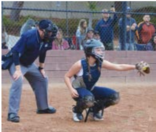
SPORTS PAGE 13