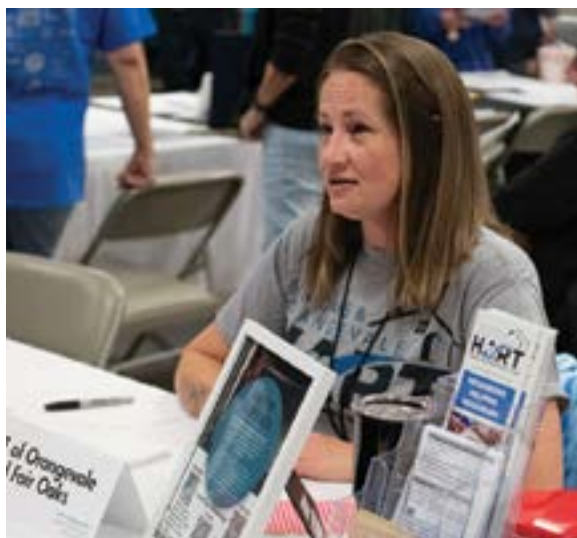
THE COMMUNITY OPEN HOUSE: A RAINY DAY SUCCESS! PAGE 14