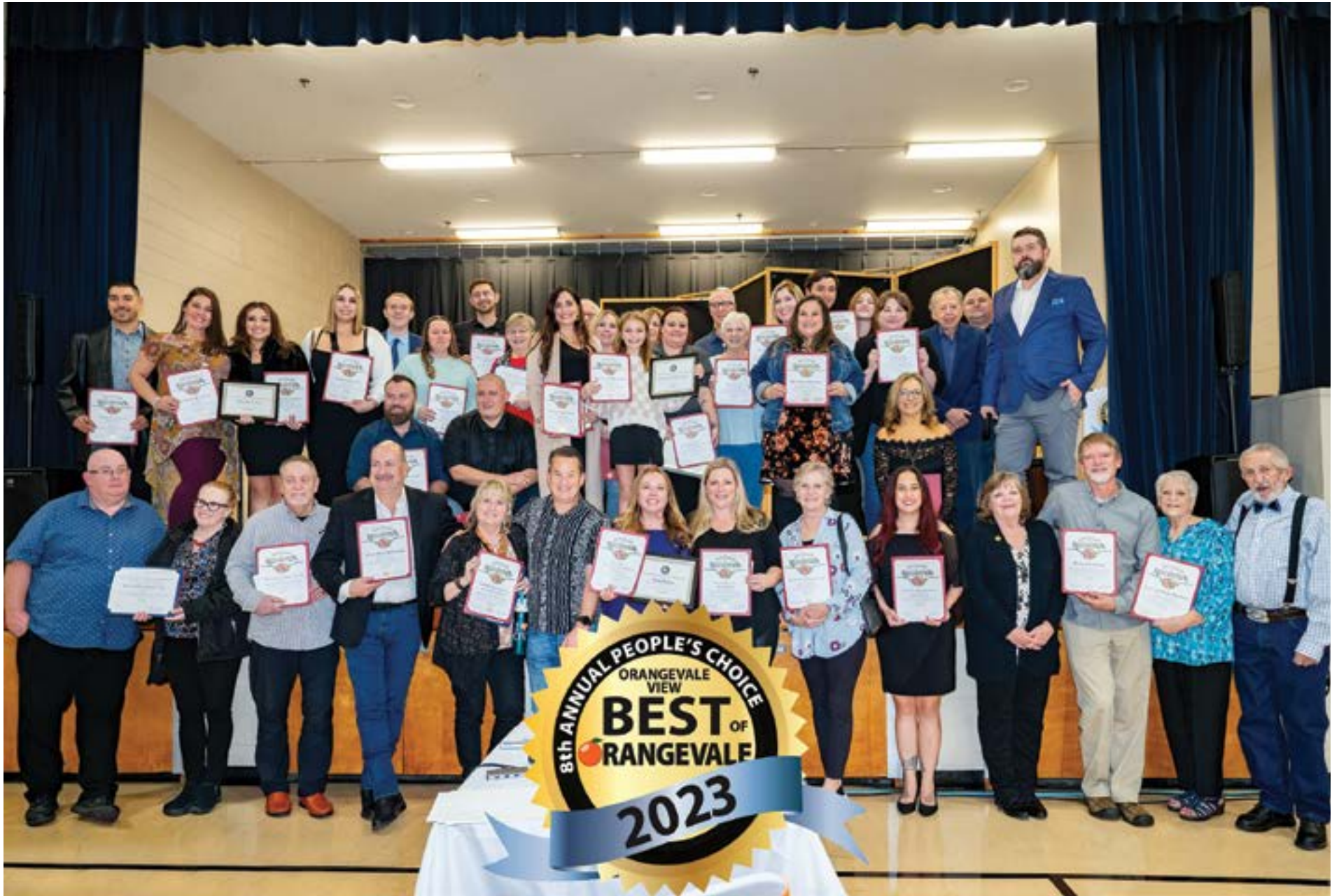
Best of Orangevale 2023 Celebrates the Best!

Orangevale celebrated their best businesses, community groups, individuals, hometown heroes and four local Legends at the 8th Annual Best of Orangevale Awards on Friday, February 2nd. The sold-out event packed the Orangevale Community Center, with finalists anxiously awaiting to hear who would win Best of Orangevale for 2023.