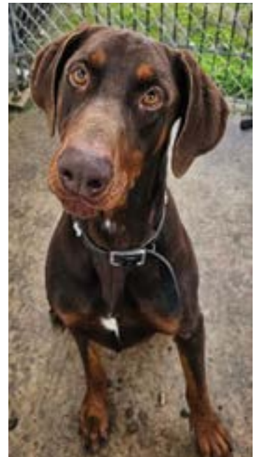
Tomasso, animal ID A850242

Bradshaw Animal Shelter is full of adorable dogs waiting to become your new best friend! All adoptions include spay/neuter surgery, up-to-date vaccinations, microchipping, and a 1 year license for Sacramento County residents. Visit BradshawShelter.net to see all available dogs and see who you fall in love with or visit the shelter at 3839 Bradshaw Rd.!