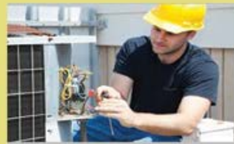
INSTALL AND REPAIR