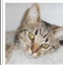
Wallace (aka Wally)

★ All kitties are fixed, tested, vaccinated & microchipped