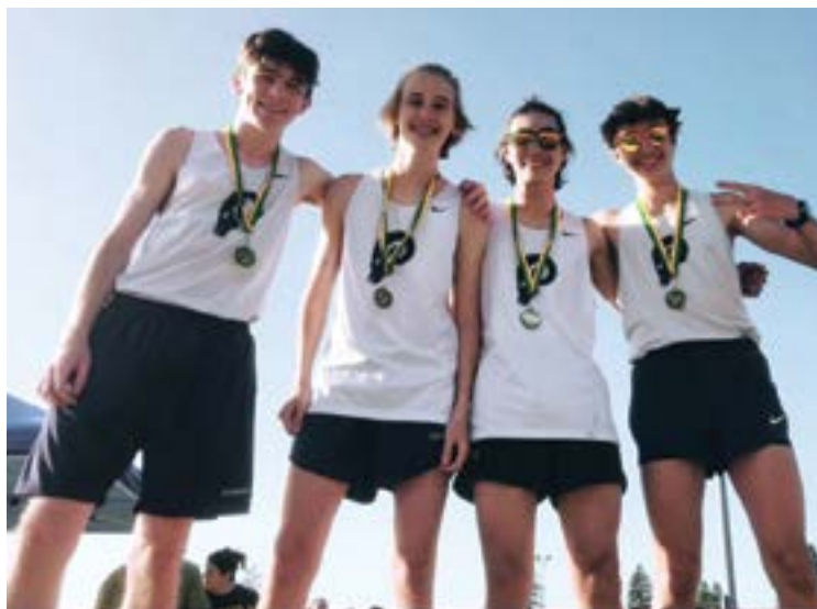
Frosh/Soph Distance Relay Winners

Casa's first Golden Empire League meet is Wednesday March 20 at Casa. Go Rams!