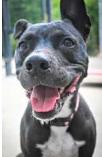
Azalea (A858843), 6 years old. "I'm sweet, petite and dog social."