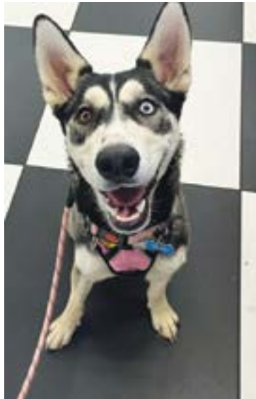
Windigo (A862457), 1 year old. "I'm sweet, affectionate, know a few commands, and I'm dog social."