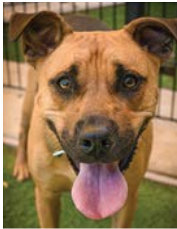
Gracie (A86459), 1 year old. "I'm friendly, gentle, and dog social."