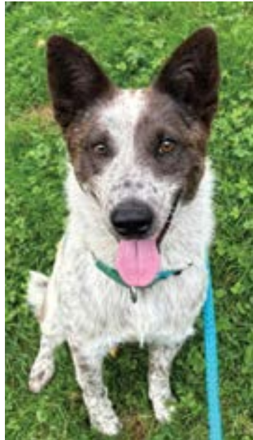
Schnapps (A863505), 1 year old. "I'm an energetic and smart, cuddle bug, who enjoys adventure."