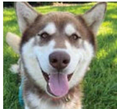
Redford (A859187), 3 years old. "I'm affectionate, playful, know commands, and dog social."