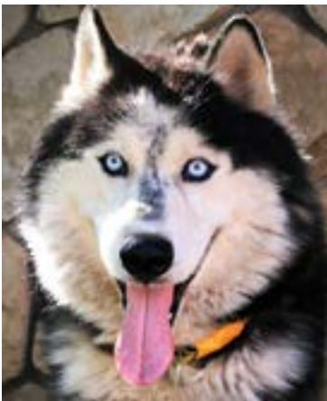
Zander (A865299), 3 years old. "I'm easy going and easy on eyes."

Kirby is a 5-year-old, 93 pound dog who is looking for her new home. Kirby is an adorable wiggle bug who is ready to play with whoever is down to join her! Once she is done, she will be happy to cuddle and pretend that she is a lap dog. Given Kirby's bigger size, her exuberance for life might be a bit much for some dogs and small children. Her adoption fee was fully sponsored by a loving fan!