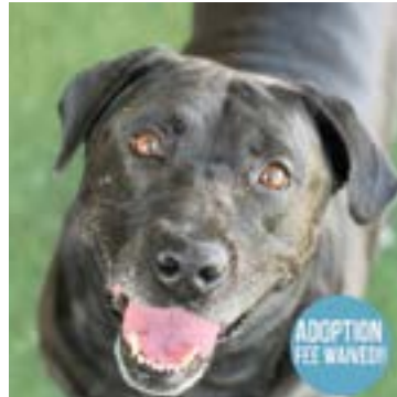
Name: Kirby Animal ID: 56031336 Breed: Lab mix Gender: Spayed Female Age: 5 years Adoption Fee: Sponsored!

Kirby is a 5-year-old, 93 pound dog who is looking for her new home. Kirby is an adorable wiggle bug who is ready to play with whoever is down to join her! Once she is done, she will be happy to cuddle and pretend that she is a lap dog. Given Kirby's bigger size, her exuberance for life might be a bit much for some dogs and small children. Her adoption fee was fully sponsored by a loving fan!