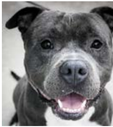
Wyatt (A866756), 4 years old. "I'm handsome, friendly, and enjoy going on walks."